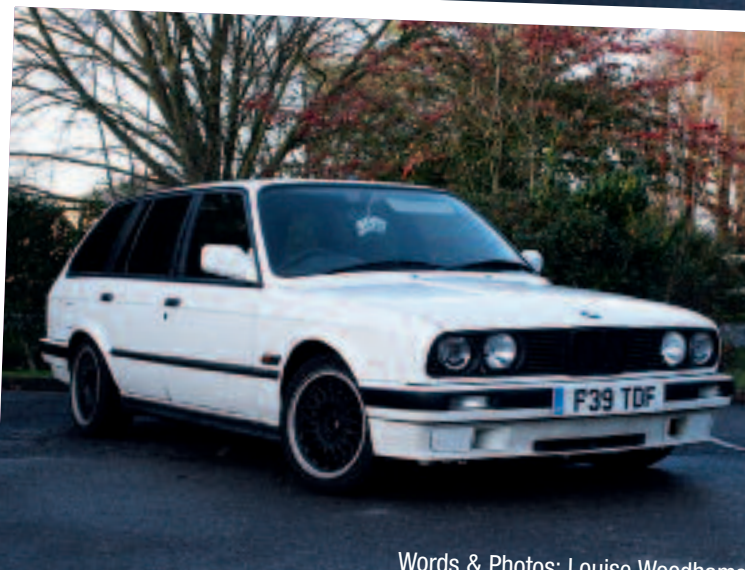
Words & Photos: Louise Woodhams