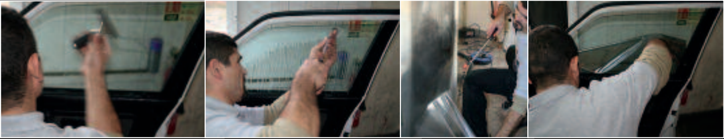
> ...and a squeegee, then applies a mist spray of water to both the glass and the film, removing the second layer to expose the adhesive. This keeps everything slippery for the next stage