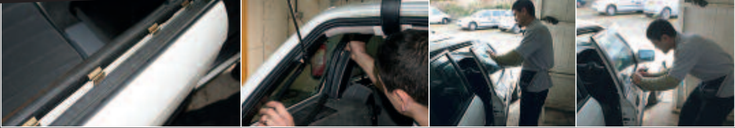
> After removing all of the window seals and relevant plastic trim, Cahit then...