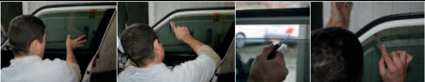
> ...with it wound down slightly so it goes over the top of the glass